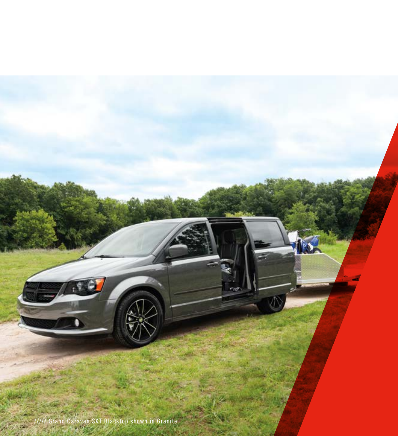
//// Grand Caravan SXT Blacktop shown in Granite.