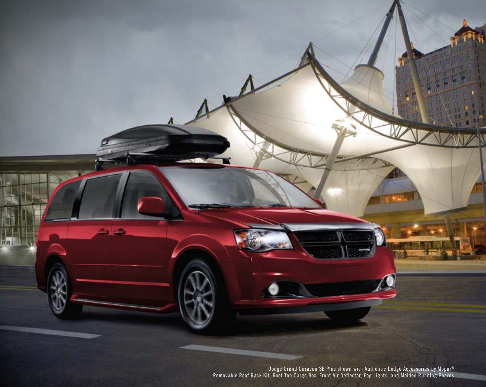
Dodge Grand Caravan SE Plus shown with Authentic Dodge Accessories by Mopar®: Removable Roof Rack Kit, Roof Top Cargo Box, Front Air Deflector, Fog Lights, and Molded Running Boards.