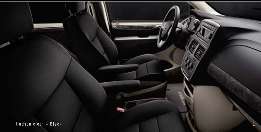
Hudson cloth – Black