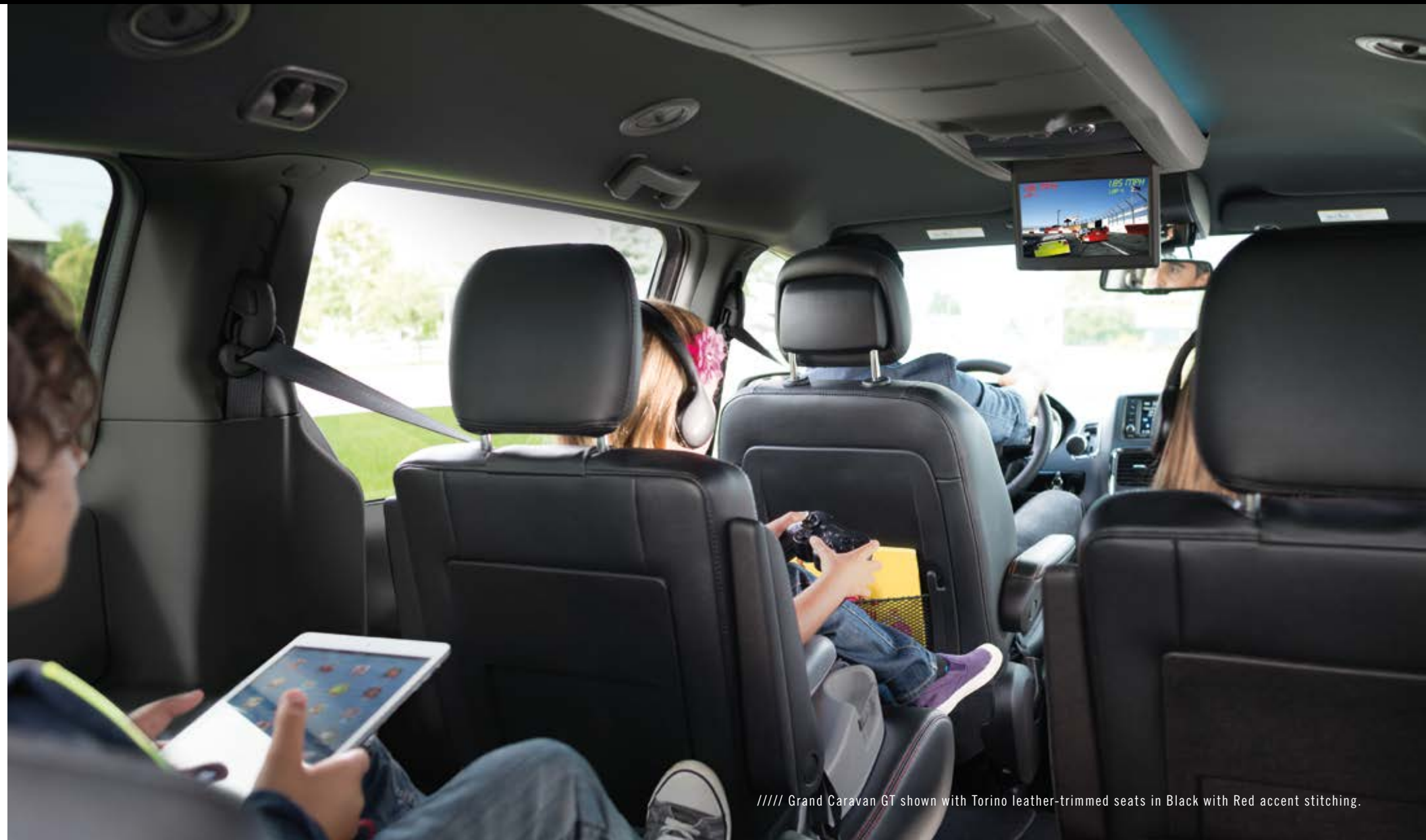
//// Grand Caravan GT shown with Torino leather-trimmed seats in Black with Red accent stitching.