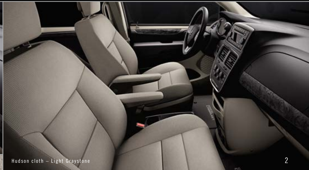
Hudson cloth – Light Graystone