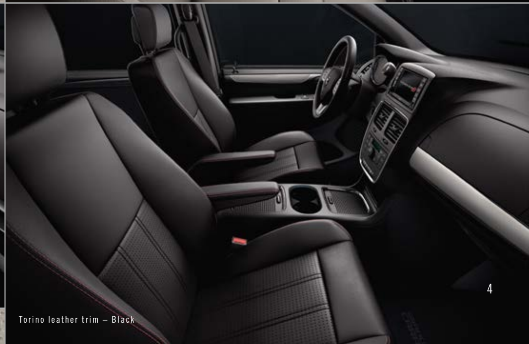
Torino leather trim – Black